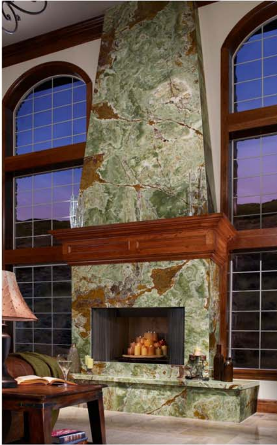
Featured: Green Onyx slab.